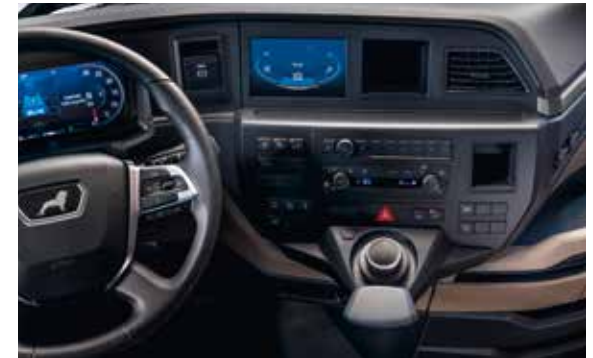
Infotainment system with 7" display and MAN SmartSelect