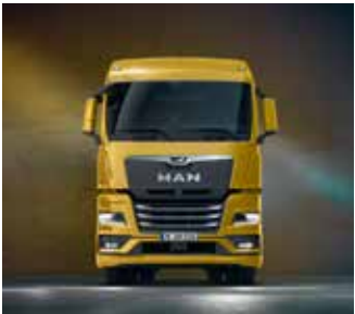
CAB GM: THE GENEROUS ONE (wide, long, medium height)