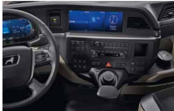
Infotainment system with 12" display and MAN SmartSelect

They are all operated via a classic control system with buttons and from the MAN premium media system models via MAN SmartSelect. Throughout, familiar usage meets innovative comfort. The result is one you can see and feel, too, as high-quality surfaces make every journey with the new MAN Truck Generation tangibly special.