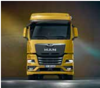
CAB GX: THE MAXIMUM ONE (wide, long, extra height)