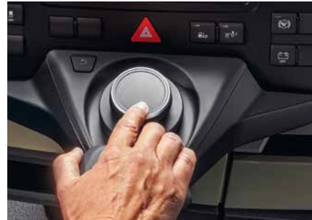
Innovative MAN SmartSelect multimedia controls

One feature is even an absolute first: the trailblazing MAN SmartSelect system, which was developed together with our customers, makes using the multimedia system child's play even in demanding driving situations. Here, too, comfort was our inspiration for eliminating the touchscreen. Functions such as map, music, cameras and more can now be operated via MAN SmartSelect with comfortable hand rest. There's so much more to discover in our new driver's cabs, so get in, get comfortable and enjoy all the new possibilities.