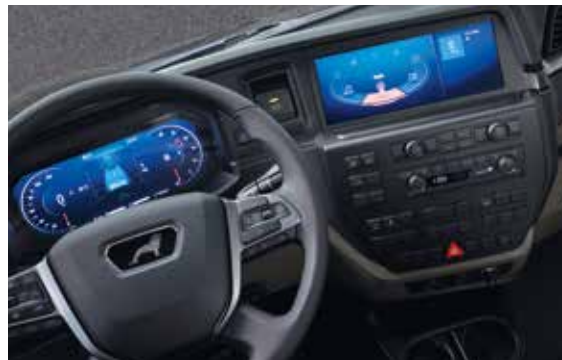
Infotainment system with 12" display and selection switch